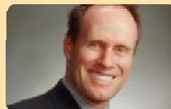
Stephen MR Covey The Speed of Trust